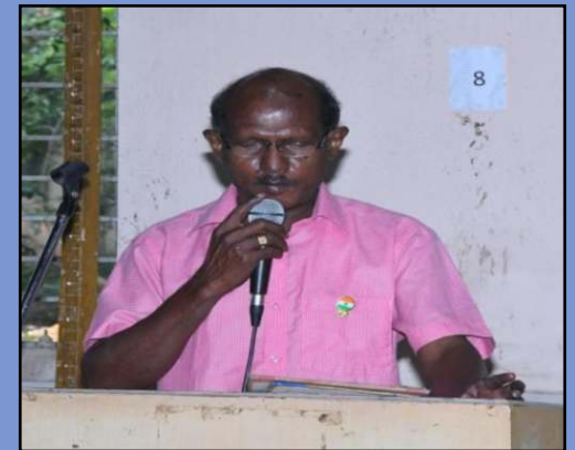
Special Programmes like Patriotic Song, Poem, Dance, etc., were given by Staff and Student Teachers