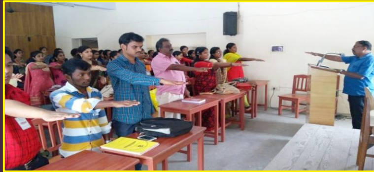
A Pledge was administered on 3<sup>rd</sup> November, 2018.