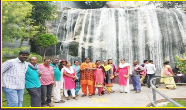
Ramoji Film City, Hyderabad