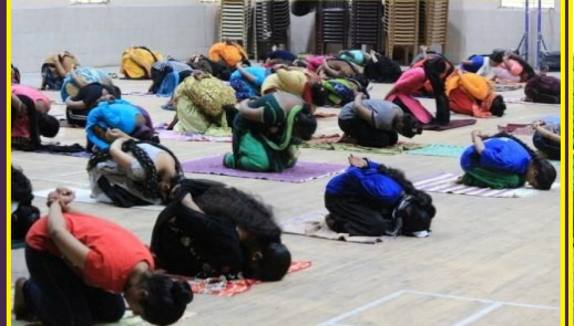
Yoga, Physical Jerks and Special games by our student teachers during the camp