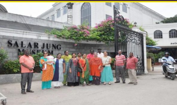
Salarjung Museum, Hyderabad