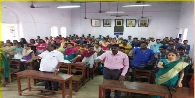
A Pledge was undertaken by our student teachers' on 30<sup>th</sup> October, 2018.