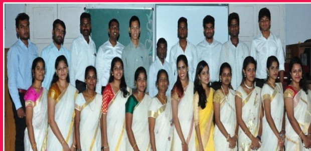
Newly elected secretaries for the academic year 2017-2018