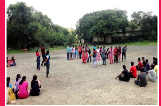
Physical Jerks and Special games by our prospective teachers during the camp