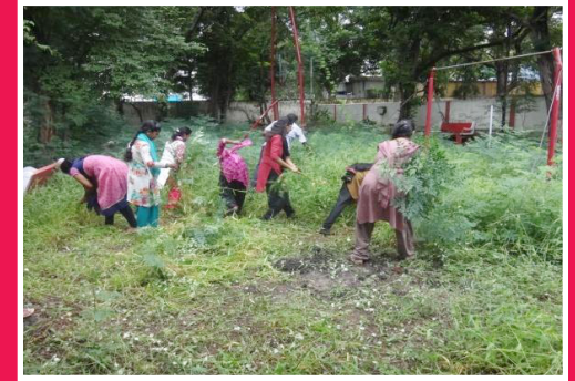
Campus cleaning by our student teachers during the camp