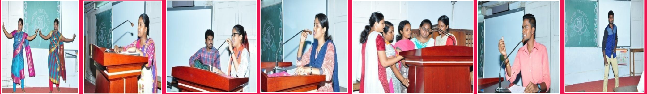
Our Students performing various programmes, during teachers' day celebration on 5 th September, 2017