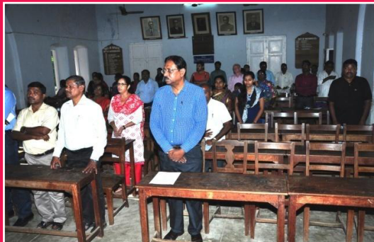
A view of Parents attending PTA Meeting.