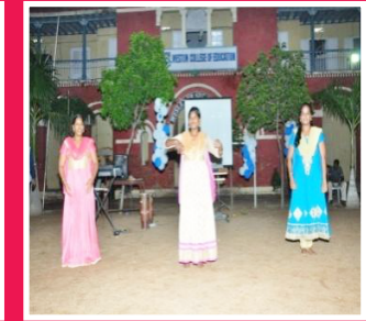
Welcome dance and Special cultural events by our students during the camp fire.