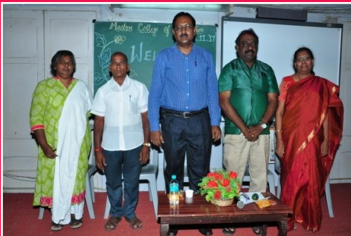
Newly elected office bearers of PTA and our College Principal, on the dias.