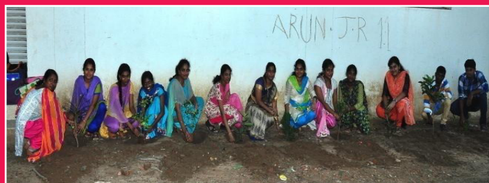
Nature Club Members (I Year) of our College planted 20 ornamental plants on 18.11.2017