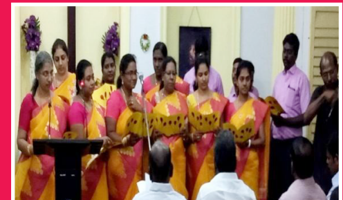
Our Meston staff performed a special number