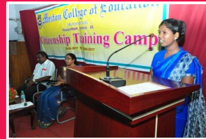
Feedback by students during valedictory programme about camp activities