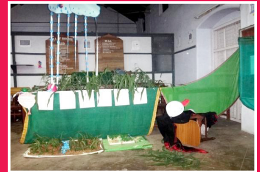
Special Kit Exhibition by our student teachers during the camp