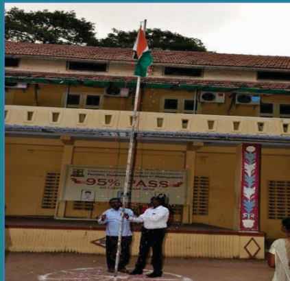
Our College Principal hoisted the tricolour National flag during 67 th Republic Day