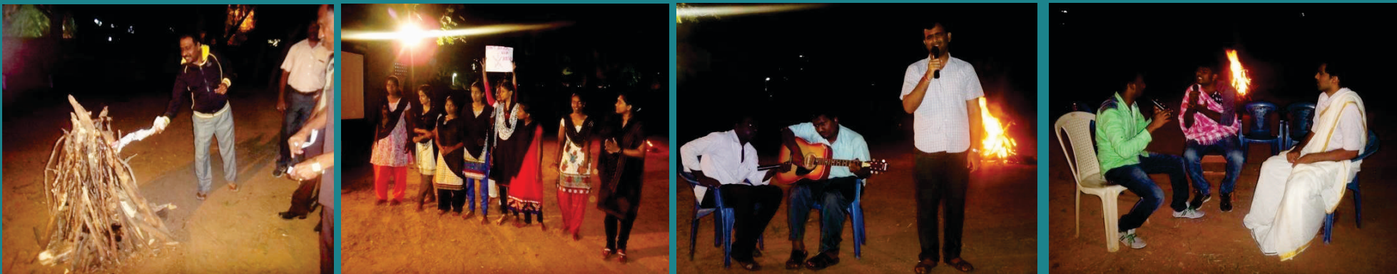
Our Principal lighted the camp fire followed by special cultural events by our students. St. John's Ambulance Association, Chennai – 94 on 22 nd January 2016.