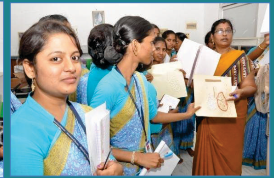
Institutional Visit to Little Flower Convent Higher Secondary School for Blind, Chennai on 29 th February 2016.