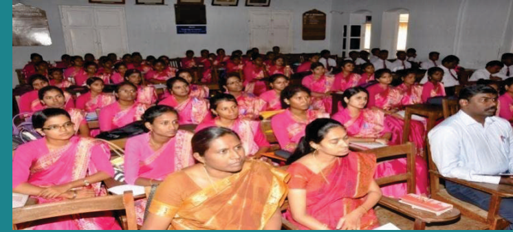
Part of audience attended the founder's day thanks giving service.