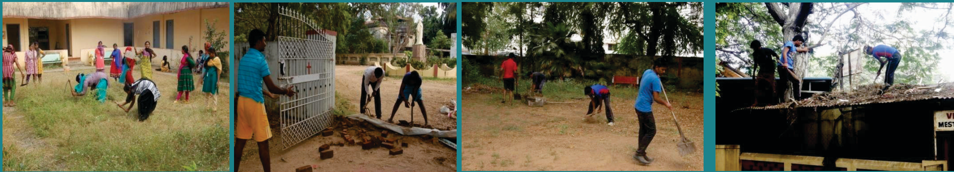
Campus cleaning by our student teachers during the camp St. John's Ambulance Association, Chennai – 94 on 22 nd January 2016.