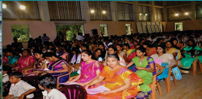
Our students attending the programme