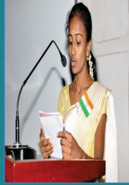
Patriotic Programmes during Republic Day