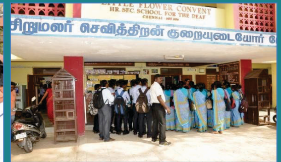
Institutional Visit to Little Flower Convent Higher Secondary School for Deaf, Chennai on 29 th February 2016.