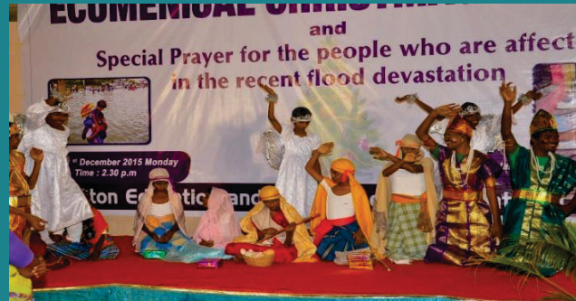
Nativity scene by our MERRC Children