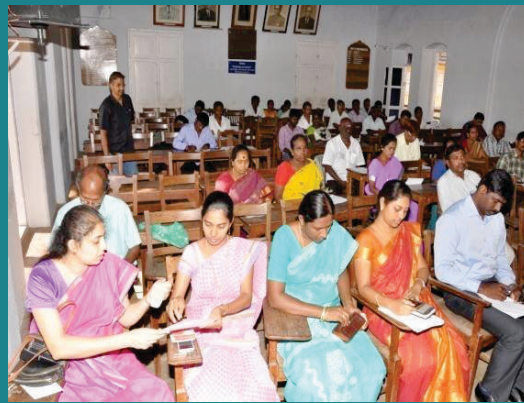
A view of Parents attending PTA Meeting.