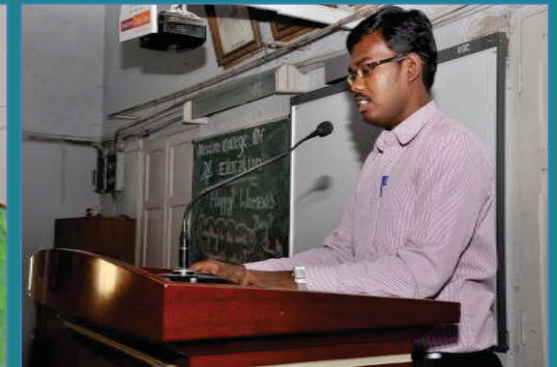
Our Students performing various programmes, during women's day celebration in our college.