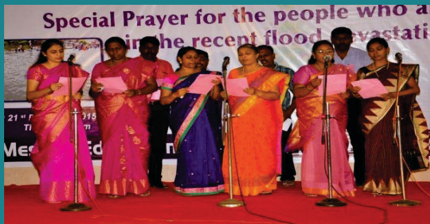
Special song by our Staff