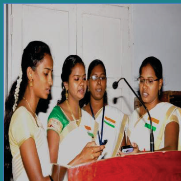
St. John's Ambulance Association, Chennai – 94 on 22 nd January 2016.