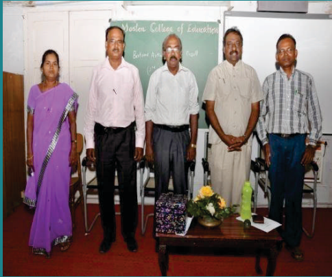
Office Bearers of Parent Teacher Association.