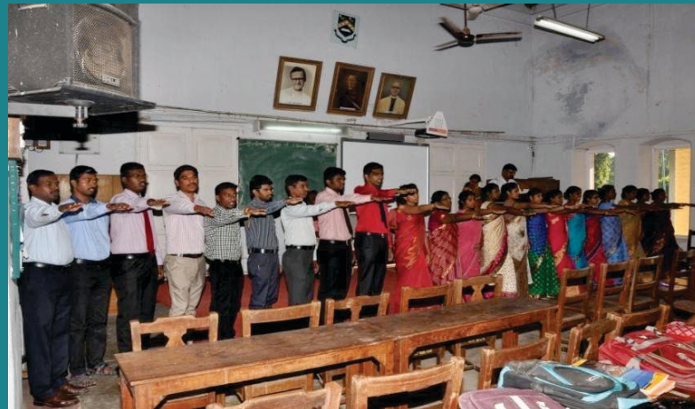
Newly elected leaders for the academic year 2015-2016 undertaking the Oath.